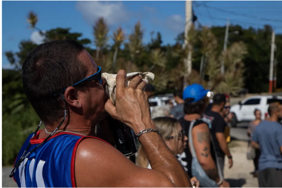
A man blows into a conch shell during a protest at a beach in Rincon, Puerto Rico, Tuesday, January 5, 2022.