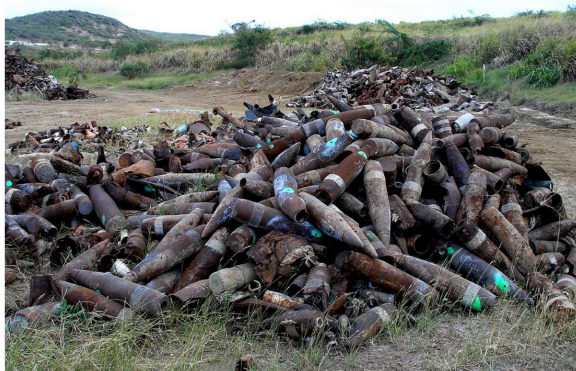
From Citizens For Safe Water Around Badger, April 22, 2019